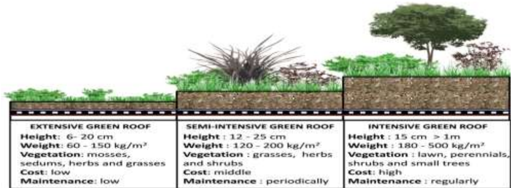
Figure 2: Types and Characteristics of Green Roofs (IGRA, 2008).

which falls between the intensive and extensive types. A pictorial comparison of the three green roof types according to the International Green Roof Association (IGRA) is presented in Figure 2.