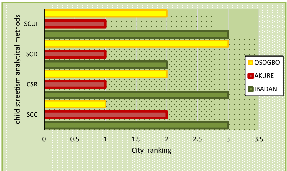
Figure 4: Child Streetism ranking by urban centres

The incongruities in the outcome of the four parameters demonstrate that they cannot, on individual strength, offer all of the facts and analysis needed to understand the variation of child streetism across space. One technique's strength is usually the other's weakness, and vice versa. As a result, establishing a composite index from the four approaches' ratios appears to be quite important.. Averages of ratios of all four methods were computed as a composite index, known as the Street Child Concentration Index (SCCI). The SCCI combines all the elements of the four methods to give the concentration of street children across the