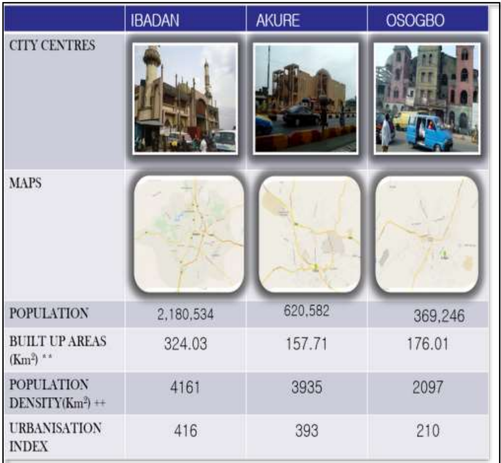
Figure 2: Comparative overview of Ibadan, Akure, and Osogbo

The assembled data (see Figure 2) of population trend and spatial extent of Ibadan, Akure, and Osogbo from a range of sources allows a comparative assessment of the cities. A visual representation of these facts (Figure 2) illustrates some remarkable differences, especially when it comes to their spread of growth, spatial expansion, population density, and urbanization level.