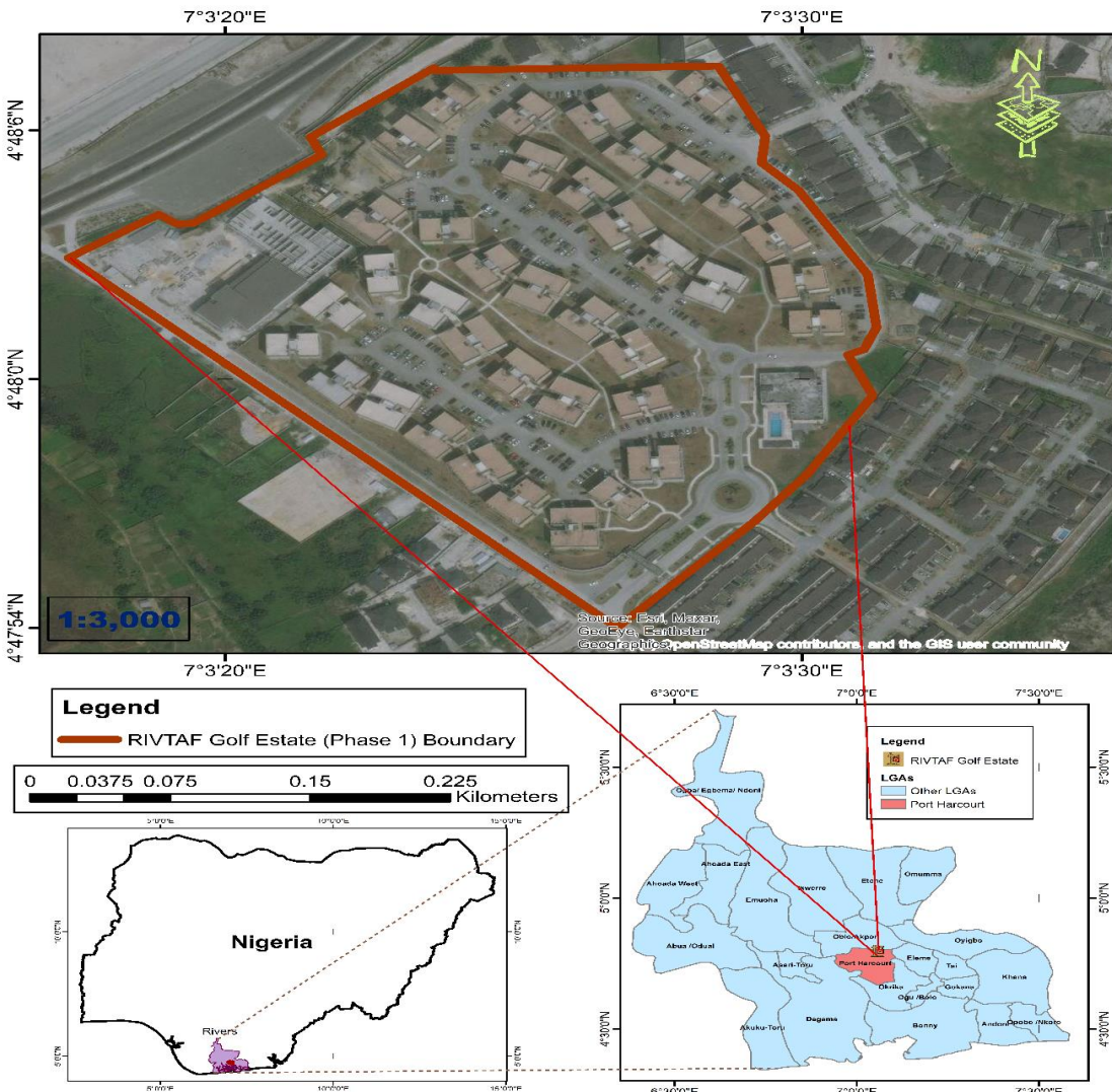
Figure 1: Base Map Showing the Study Area (RIVTAF Golf Estate)

Phase 2 have 120 units of 4/5 bedroom luxury villas; 30 units of 4-bedroom town-houses; 180 serviced plots for town-houses/villas and 9-hole golf course. This paper focused on phase 1 as phase 2 is not 100% completed. Figure 1 shows the RIVTAF Golf estate.