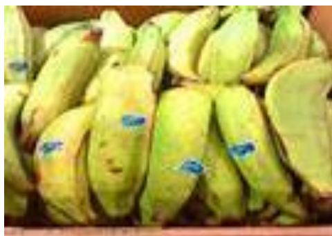
Fig. 1: The exterior view of the plantain (Covenant University farm)

Plant Material: Plantain fruits were purchased from Covenant University farm, Ota, Nigeria. Fig. 1 shows the picture of Musa x paradisiaca .