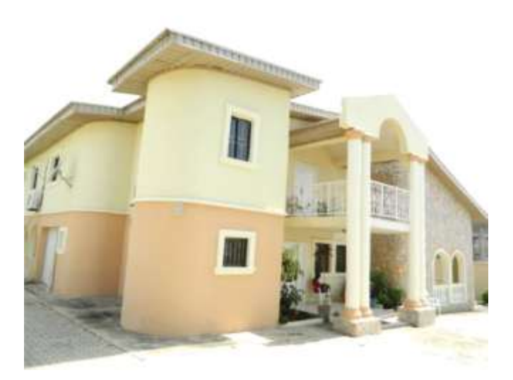
Plate: 1. A thin, protruding floor level definer (FLD) on a contemporary Ornamentation genre; in conjunction with the color differentiation application mark the floor level

The structure in Plate 1, built in 2003, belongs to a journalist. The building had been renovated thrice in compliance with the extant environmental standards. The façade bears a double twin column overhanging a vaulted arch, which emphasizes the building portal. The simplicity of his house is attractive.