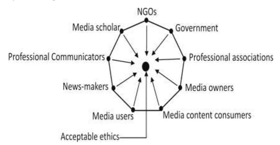
Figure 1: Recommended stakeholders needed to evolve acceptable ethics for a typical journalism practice

In this paper, we present a modified set of stakeholders that should be recognized in order to develop an acceptable ethical system for conflict-sensitive journalism.