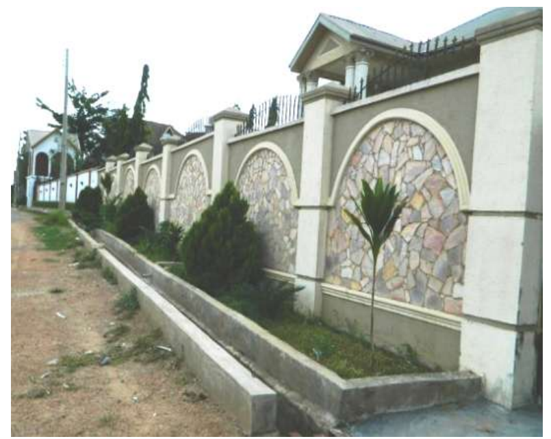
Plate 4a: A Contemporary High Fence Belonging to the Gate in Plate 4b.

biblical demon that specializes in usurping people's blessings. The gate is high, so is the fence. One could only observe the roof of the storey buildings behind the walls. These frontal elements (gate and fence) are not looking friendly at all. The gate is solid metal with a high grade gauge up to the top. The upper part has decorations with piercing, pointed rods, welded to a curved framework, ready to waste the blood of its victims.