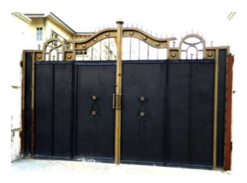
Plate 4a: A 'mean' looking gate detesting the presence of strangers