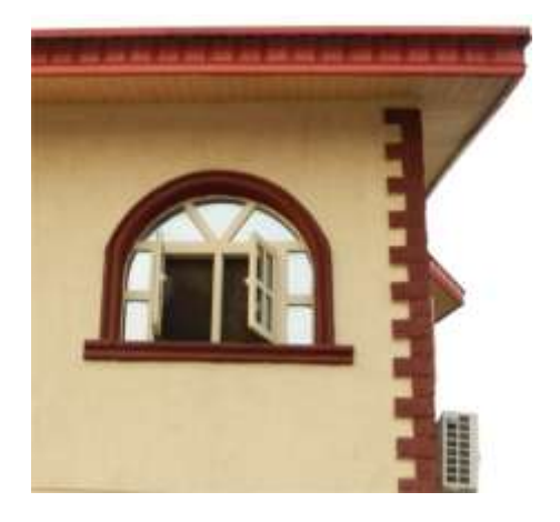
Plate 3: An arched contemporary window design

contemporary taxonomy of window designs is diverse and appealing. achieved aesthetics Thev with different shapes and sizes. The designs hardly have hoods except one example located on one of the chalets of an almost completed building in the GRA. The buildings compound are in the actually completed and at the finishing stage.