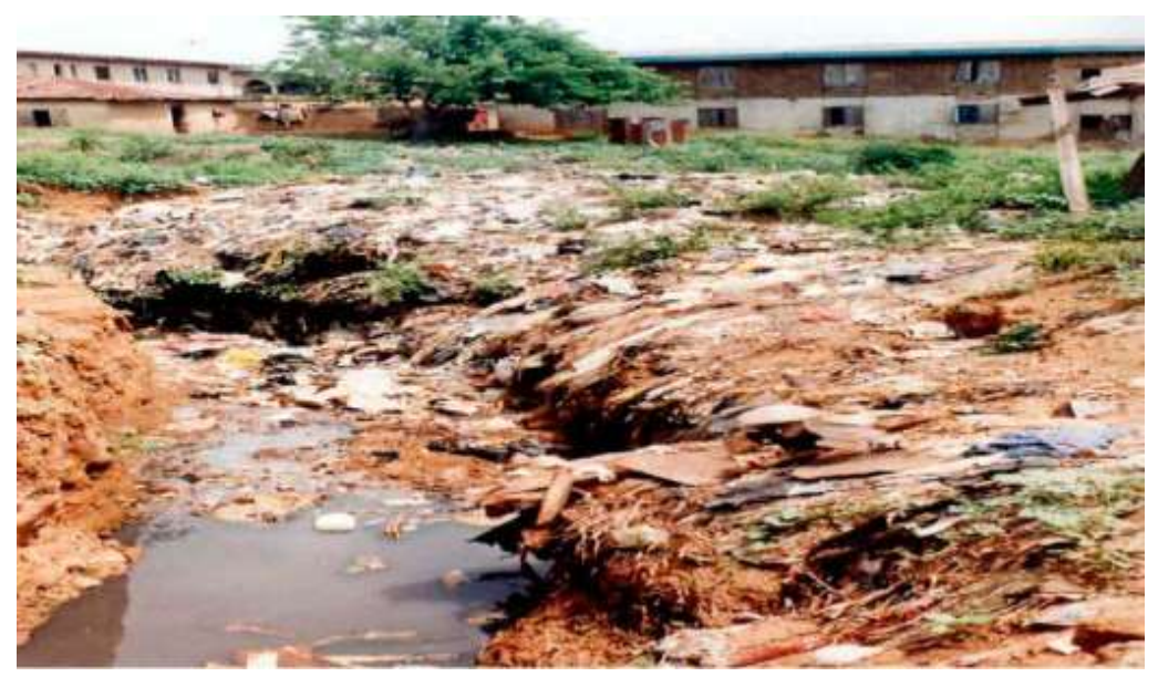
Plate 2: An unsightly drainage channel used as refuse dumps in the core of Ibadan, Nigeria.