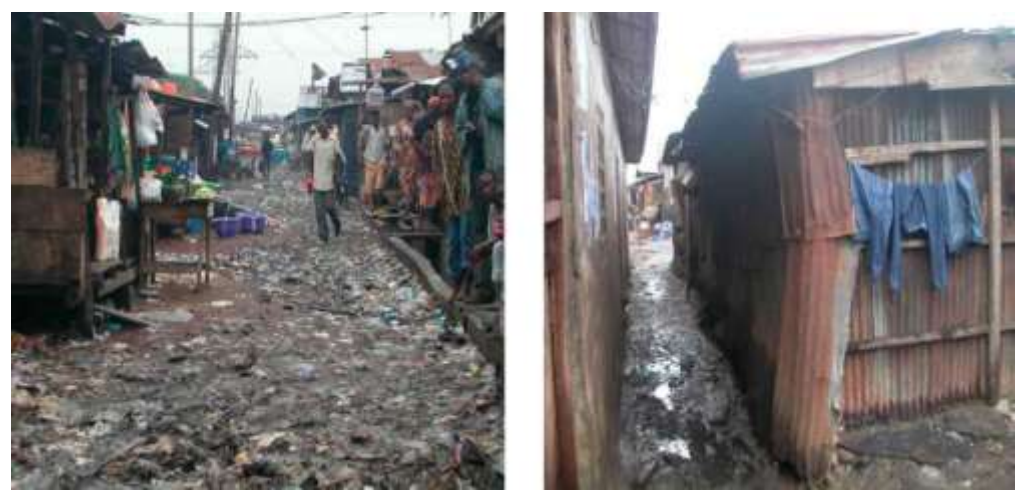
Plate 1: A typical urban slum situation in Ajegunle Lagos, Nigeria.