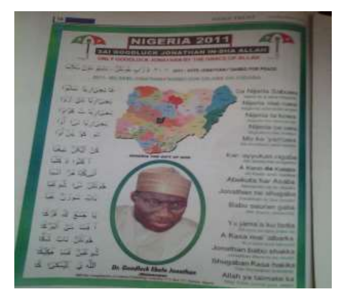
Fig. 14: Daily Trust, March 15, 2011

In Fig. 15 ( The Guardian , April 5, 2011) below, graphology is strategically deployed in form of a handwritten letter to index a poor albeit ardent Hausa supporter of Buhari. In this way, the producer attempts to validate CPC's claim that its candidate is loved and supported by the Nigerian masses. ACN also ideologically indexed child