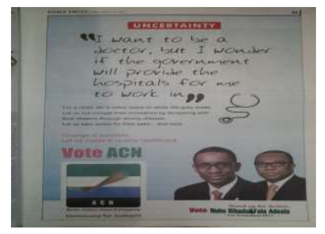
Fig. 16: Daily Trust, March 25, 2011