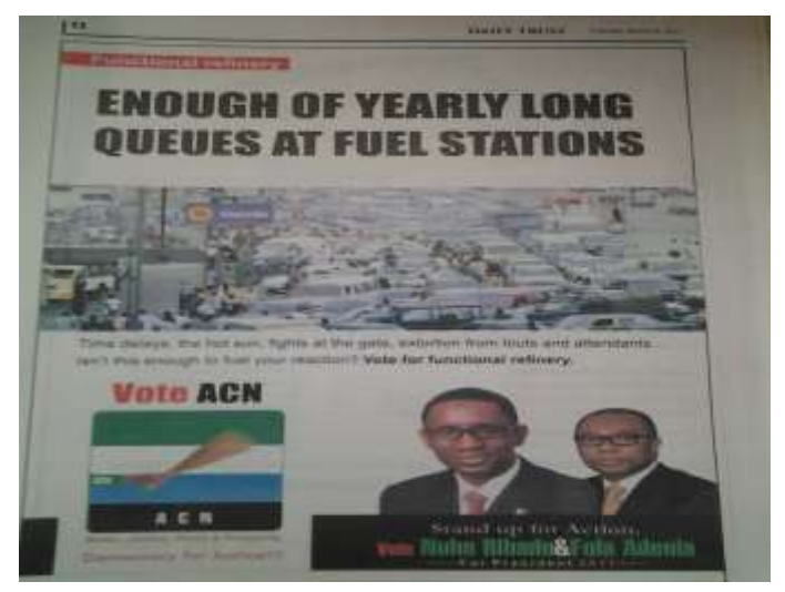
Figure 9: Daily Trust, March 8, 2011

Fig. 10 on the other hand, is PDP's reaction to Fig. 9 (Daily Trust, March 8, 2011). A typical discourse of the powerful is enacted through semiotic resources of pictures and number to counter ACN's claim of perennial fuel scarcity in the country. The advert contains five pictures and a body copy which is placed under the pictures. The pictures are separated by frame lines. Framing helps to signify positional differences of both parties on the claim of a fuel scarcity free situation in Nigeria under Jonathan's administration. The semiotic potential of framing is that disconnected elements could be read as separate and independent or even contrasting units of meaning whereas connected elements could be read as belonging together in one way or