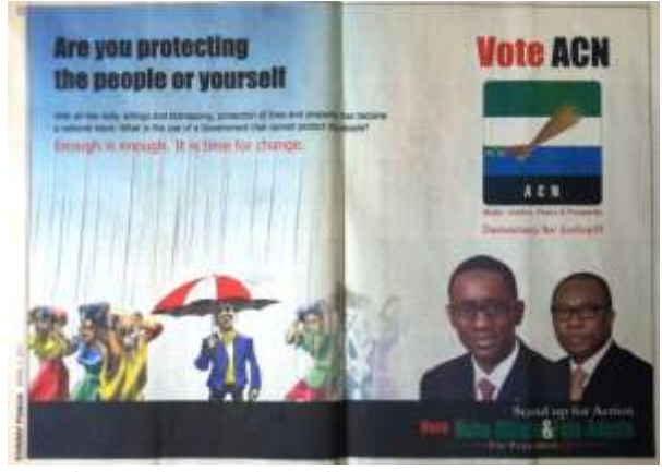
Fig. 1: The Punch, April 3, 2011

respectively. Figures 1, 2 and 3 below are examples of the ways in which advert producers exploited visual metaphor to implicitly represent Jonathan and PDP negatively and Ribadu and his running mate, Fola Adeola positively. In Figure 1 below, cartoon is used as a semiotic resource to attack Jonathan's image.