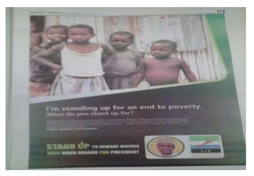
Figure 7: Daily Trust, February 11, 2011

Fig. 8 below is PDP's visual attempt at negating the idea of government's failure to provide good life for Nigerian children. It contains two pictures which are separated by a frame. The bigger picture is that of a group of participants which includes a teacher and some school children who are involved in a collaborative classroom activity. The close shot of the picture enacts an inclusive discourse of closeness between the represented participants and the reader. In other words, the picture seems to affirm the claim that the classroom environment shown in the advert is a familiar experience for the reader also. While some of the participants are pictured frontally others are represented obliquely. However, they all look directly down at the textbooks on the table rather than at the reader. Pictured in this way, an exclusive discourse is produced in which the teacher and pupils seem to be involved in their own world of academics.