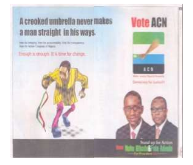
Fig. 2 is an ACN advert, which also presents a caricature of Jonathan and PDP. The metonymic representation of PDP and its candidate is achieved through the use of an illustration of a man holding a damaged umbrella. The colours of his attire are significant. His shirt is yellow and this signifies excitement, youthful exuberance and

common features of size and sharpness of colour so that they are the most salient elements in the advert. This signifies a demarcation between the chaotic world of the Nigerian masses under the PDP government and the promised calm world of the ACN candidates In contrast to the participants in the cartoon, the ACN candidates on the right are visually represented through close shot, direct gaze and friendly looks as warm and willing to enter into a cordial relationship with the reader. In all, the central message of the advert is that the Umbrella and by extension PDP government provides protection only for party leadership, their members and supporters rather than the masses.