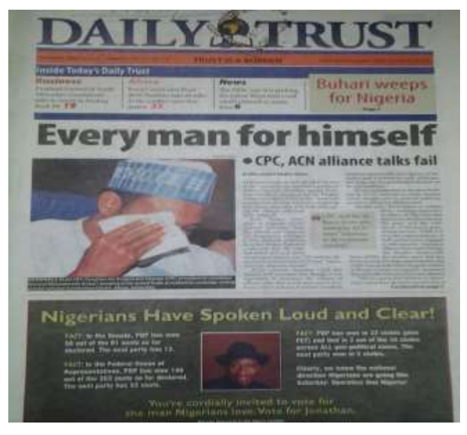
Fig. 13: Daily Trust, April 14, 2011