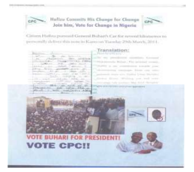
Fig. 15: The Guardian, April 5, 2011

speakers in some of its adverts through the use of childlike handwriting. In Fig. 16 ( Daily Trust , March 25, 2011) this strategy is used to index child speakers in order to influence the feelings of the reader and get her/him disenchanted with the suffering of the masses under the PDP government.