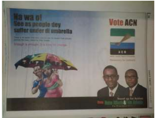
Fig. 3: Daily Trust, April 14, 2011

reader. The long shot of the picture also signifies social distance between him and the reader, which means that he is detached from the reader and seems to be involved in his own troubled world. Presented in this way, the advert suggests that PDP is not a dependable party and thus its presidential candidate could also not be reliable. The alternative leadership is presented in the pictures of the ACN presidential candidates who are attired officially in dark suits, white shirts, red ties and recommended eye glasses. Presented in this way, Ribadu and Adeola are positively represented as technocrats and the ideal leaders of a modern democratic government. In addition, their frontal and direct gazes indicate their well-defined focus and desire for a close relationship with the electorate.