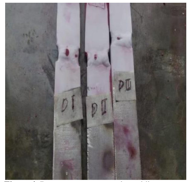
Figure 4: Dye penetrant test results welding process using nikko steel electrodes which are coolant dipped

Figure 3 shows that the SMAW welding using weld electrode Nikko Steel type E308 with dipped in oil only slightly occurred welding defects, namely in the specimen (CI), even that is caused by the operator expertise. Welding using welding electrodes Nikko Steel type E308 dipped in coolant, after the dye penetrant test is done the results look like in Figure 4.