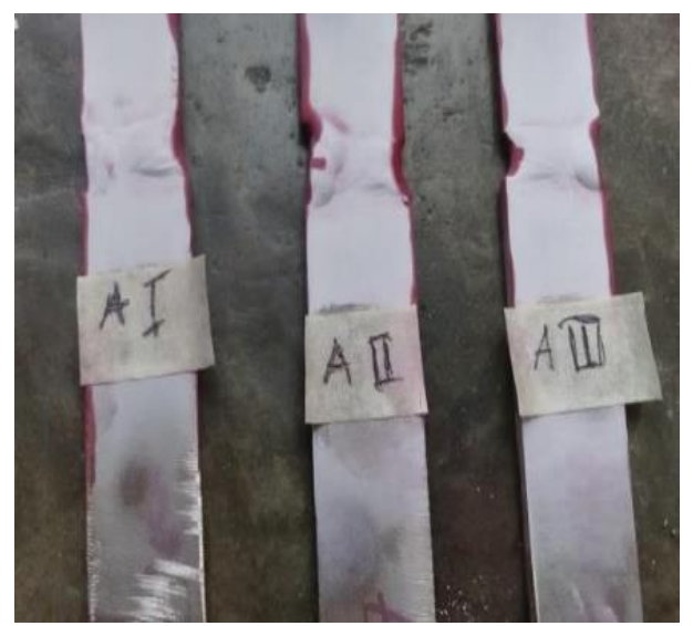
Figure 1: Dye penetrant test results welding proses using gutwelt welding electrodes

Dye penetrant tests were carried out in order to find out the quality of the welding process using different welding electrodes, whether or not they met the requirements. The results of welding using Gutwelt type E308 welding electrodes, after the dye penetrant test is performed looks like in Figure 1.