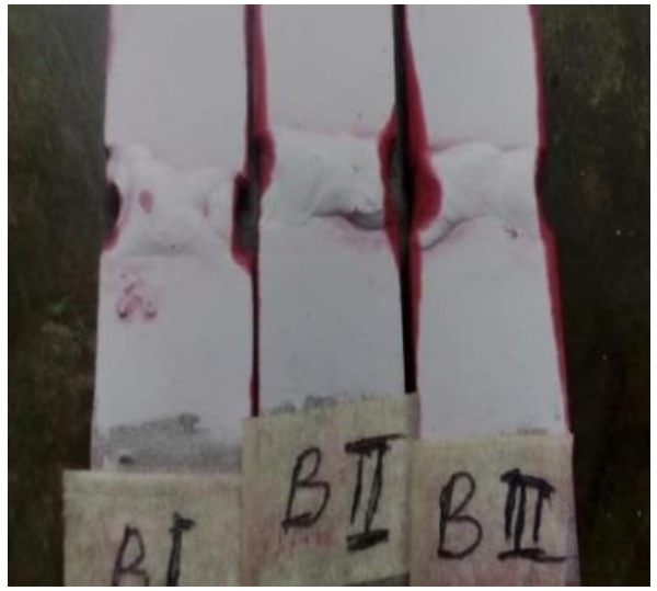
Figure 2: Dye penetrant test results welding process using nikko steel welding electrodes

From Figure 1 shows that SMAW welding using Gutwelt type E308 welding electrodes only slightly experienced welding defects, namely in the specimen (AII). Welding defects that occur due to the welding operator expertise. Welding using the Nikko Steel type E308 welding electrode after dye penetrant test results are shown in Figure 2.