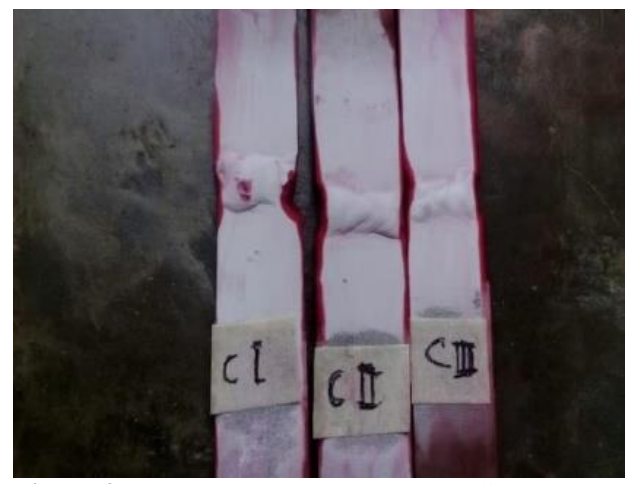
Figure 3: Dye penetrant test results welding process using welding electrodes nikko steel with dipped in oil

From Figure 2 it can be seen that the SMAW welding using the Nikko Steel type E308 welding electrode occurs only slightly welding defects, namely in the specimen (BIII). The defect is caused by the expertise of the welding operator. Welding results using welding electrodes Nikko Steel type E308 oil dipped, after the dye penetrant test can be seen in Figure 3.